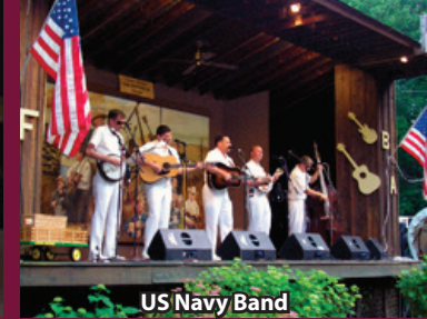
US Navy Band