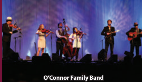
O'Connor Family Band